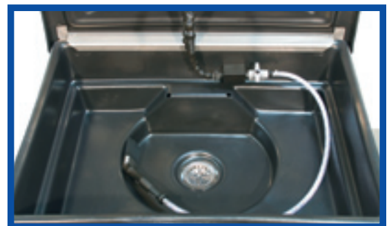
Shelf removed provides soaking area.